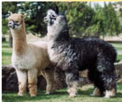
Dom Lucillo and General Schwarzkopf

Note: Graphic samples are not shown at the same scale.