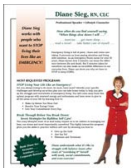
Full color one sheet