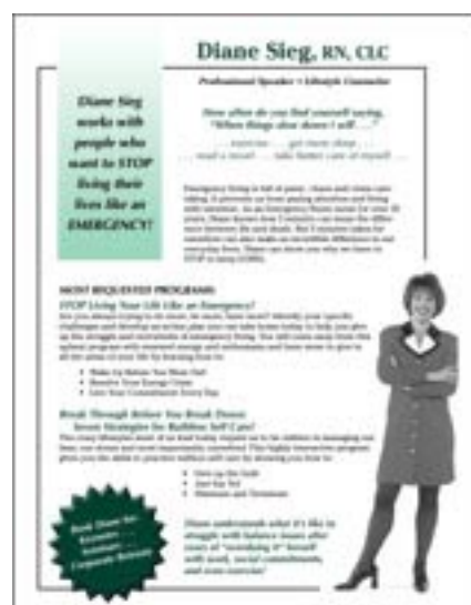
2-color one sheet

Four color (full-color process printing) is approximately 79% more than one color.